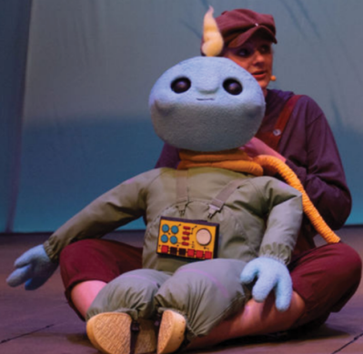
The Little Prince by Antoine de Saint-Exupéry